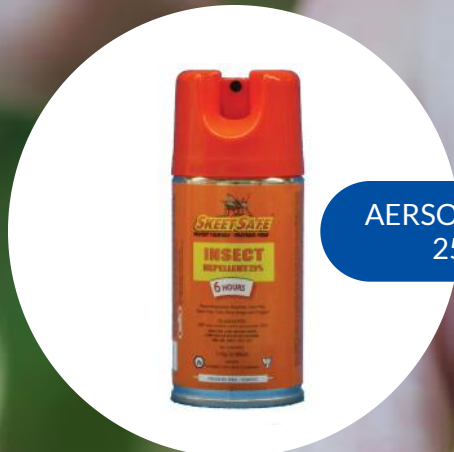
AERSOL CAN SPRAY 25% DEET