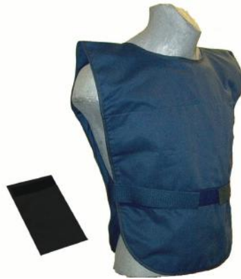
Qwik-Cooler Vests with Cooling Inserts