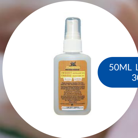
50ML LIQUID SPRAY 30% DEET