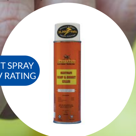
WASP & HORNET SPRAY 350G CAN, 35KV RATING

Here's what you need to know about DEET: