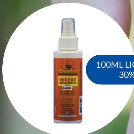
100ML LIQUID SPRAY 30% DEET