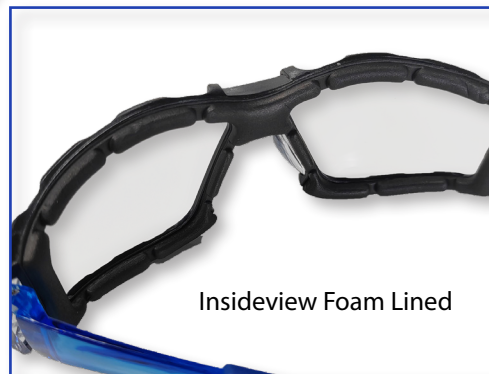
Insideview Foam Lined